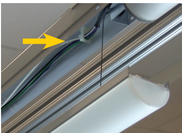
Simplified wire management