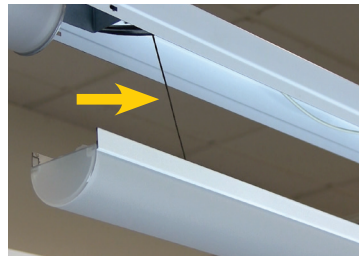
Suspension cable allows lens to hang hands-free during wiring