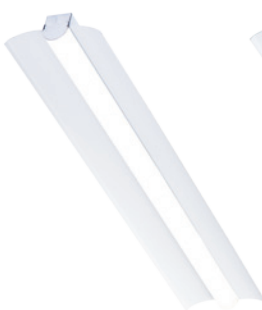
LED Surface Ambient Luminaire with Solid Reflectors: • LS4-SR 4-foot • LS8-SR 8-foot