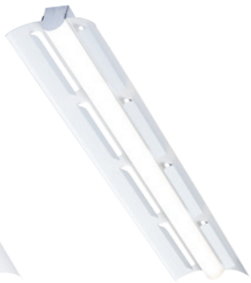
LED Surface Ambient Luminaire with Apertured Reflectors: • LS4-AR 4-foot • LS8-AR 8-foot

Product specifications subject to change at any time. *Visit http://creecanada.com/products/interior/surface-ambient/ls-series/ for recommended dimming controls and wiring diagrams.