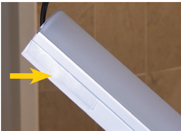
Pull tabs for easy lens removal