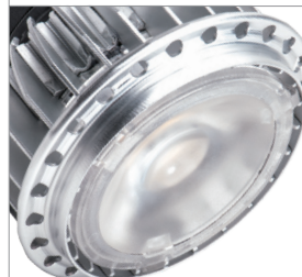
40° Beam Angle

Visit www.cree.com/canada or contact a Cree lighting representative to learn more