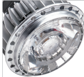
15° Beam Angle