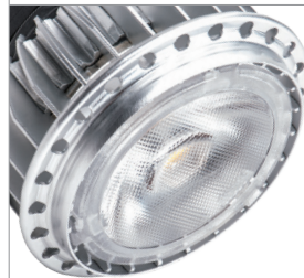
25° Beam Angle