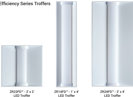
ZR22FD™ - 2' x 2' LED Troffer